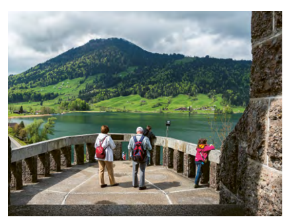
↑ From the platform, you can enjoy views of the lake and mountains.