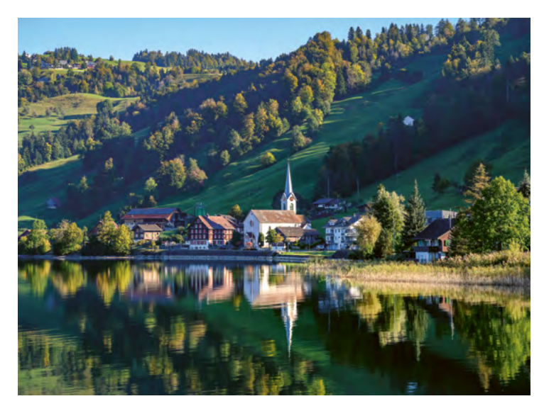
↑ The village of Morgarten is right by the lake.

worth a visit. For now, however, our route takes us left and up, through meadows and sparse forest, past some beautiful observation points and towards Schornen, which is not only the scene of the famous historical events, but also the site of the battle chapel, the Morgarten Trail information centre and the Letziturm tower. The tower is the striking remains of a medieval dam that is no longer visible today, but was maintained and used until the 18<sup>th</sup> century. After the tower, the route takes you along quiet paths past individual farms and lots of animals towards Oberägeri, before finally reaching the Morgarten Monument. This imposing structure, inaugurated in 1908, may not be to everyone's taste, but the view from up here is magnificent, and there are also places to sit and have a bite to eat.